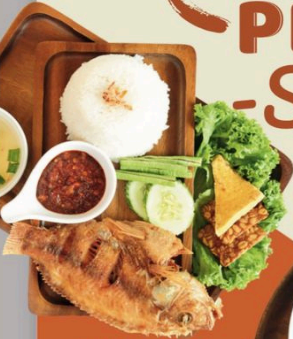
TALAPIA PENYET RM14.9