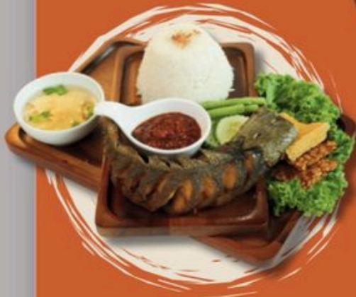
KELI / LELE PENYET RM10.9