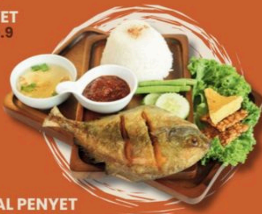
BAWAL PENYET RM 15.9