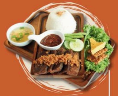
DAGING PENYET RM13.9